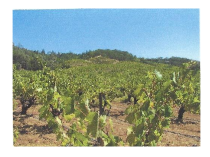
90 year old vines at Carreras Dry Creek Vineyard

Tasting Notes: The 2012 Zinfandel is bold and full bodied with dark berry fruit and mocha. With flavors of raspberry and spice, the wine is rich and chewy with a silky, smooth finish.