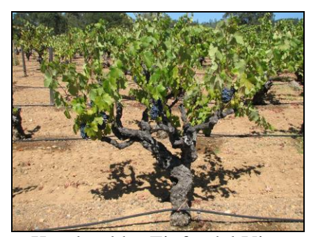
Knarly older Zinfandel Vine

The '2011 Lodi Zinfandel is made in a ripe, fruit forward style showing lots of raspberry aromas and flavors of blackberry, mocha and licorice. This beautifully balanced wine is rich and supple in the middle, finishing with ripe, juicy tannins.